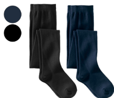
Event Tights (Cable or Opaque) Friday Knee-high Socks