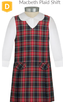
Peter Pan Collar Shirt with Macbeth Plaid Shift