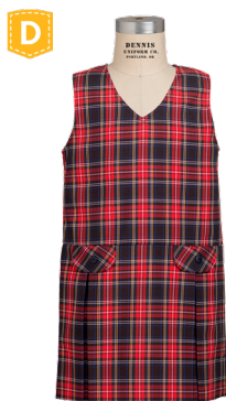
Macbeth Plaid Shift