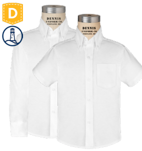
White Oxford Shirt