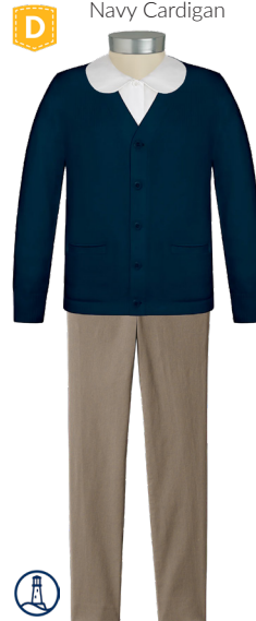
Peter Pan Collar Shirt with Navy Cardigan