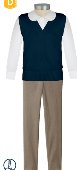
Peter Pan Collar Shirt with Vest and Khaki Pants